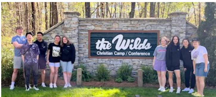
(Senior Trip, Continued from page 9)

down the Nantahala River in North Carolina. The water temperature hovered near 40 degrees – a mix of refreshing and bone-chilling! The evening chapel focused on God being the greatest need in your life. For the students, the message was intended to be a warning sign as well as a point of decision.