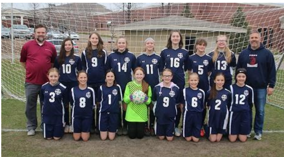
Warrior JH Girls Soccer Team