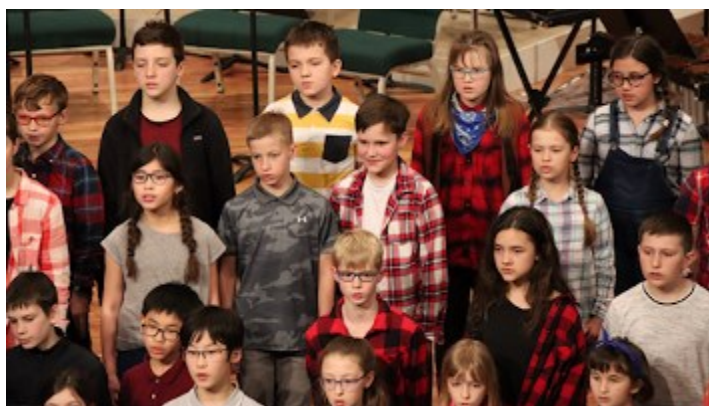
Elementary Choir (4th—6th Grades)