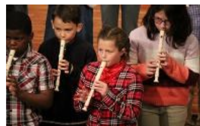
4 th Grade Recorders