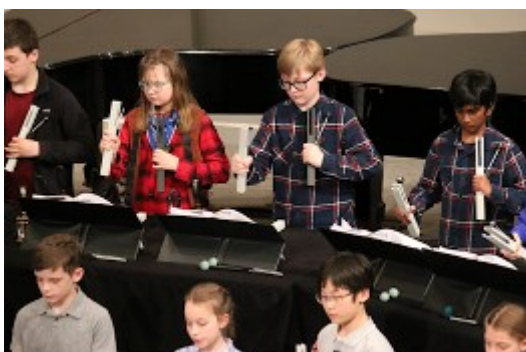
5 th Grade Chimes