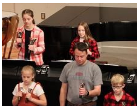
6 th Grade Handbells