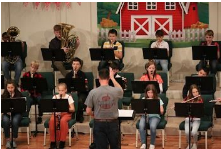
6th Grade Band

Elementary students and families enjoyed a packed day of spelling bees, informances, and a spring concert on April 29. K4 and K5 family members joined our students for an “informance”—an interactive music class in which guests participate with our students. Our children loved showing their parents how to distinguish between high and low sounds with the help of a few puppet friends and other hands-on activities. Children pulled parents in on the fun several times for simple circle games and folk dances.