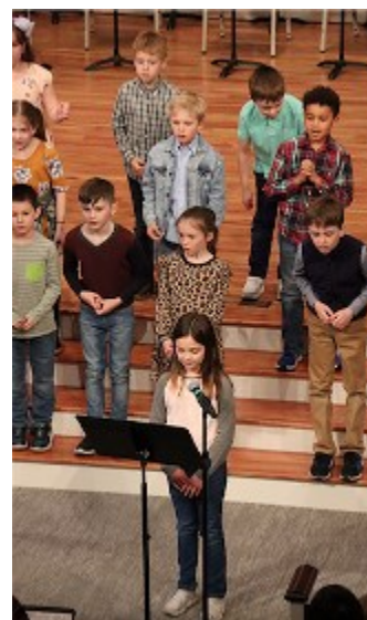
2 nd Graders