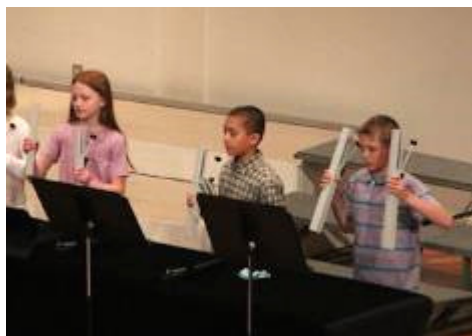
5th Grade Chimes