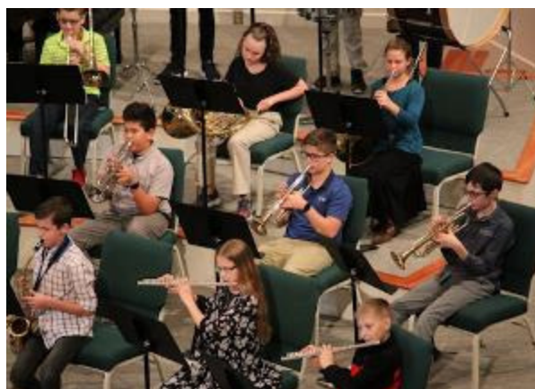
6th Grade Band