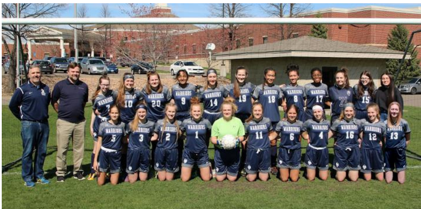
Warrior Varsity Girls Soccer Team