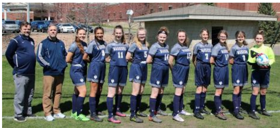
Warrior JH Girls Soccer Team