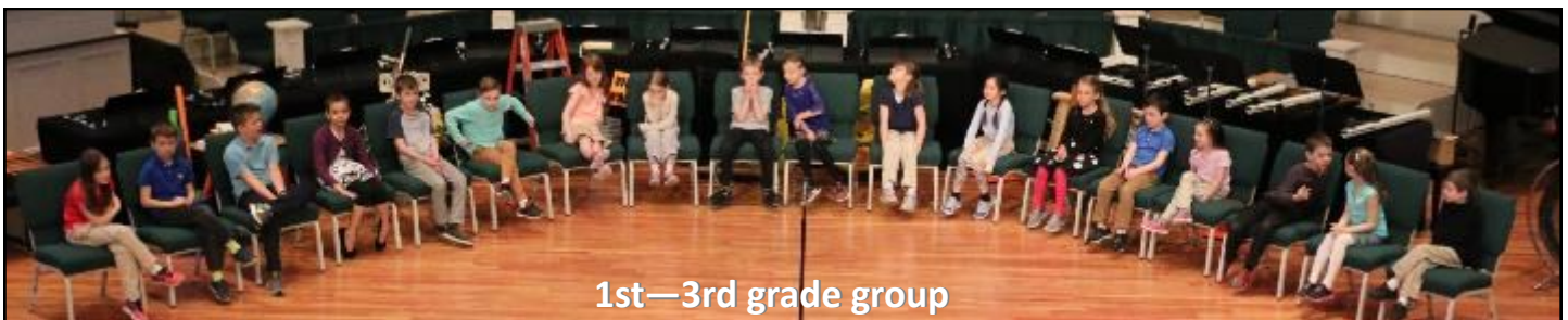
1st—3rd grade group

We congratulate all participants who were chosen to take part in this year's spelling bee, with a special congratulations to this year's winners. Well done! ☺