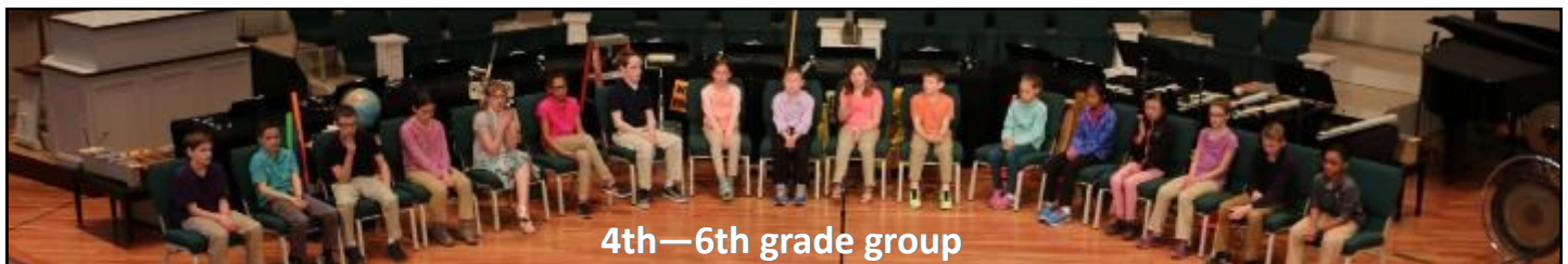
4th—6th grade group