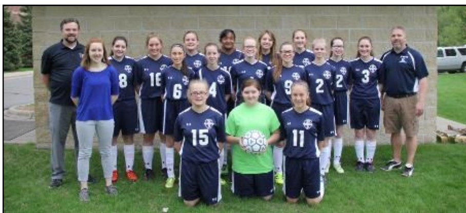
Varsity Girls Soccer Team pictured above, and JH Girls Soccer Team pictured below.