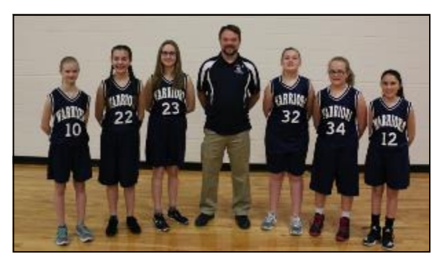
JH Girls Basketball Team White