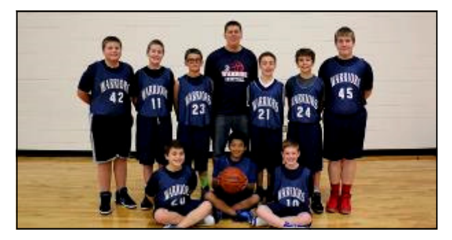
JH Boys Basketball Team BLUE