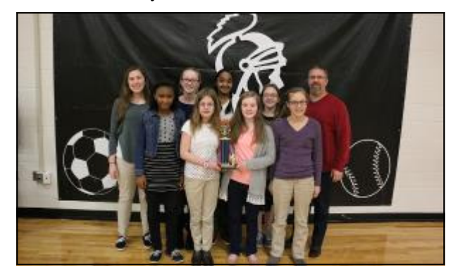
JH Girls Basketball Team Blue w/3rd place trophy