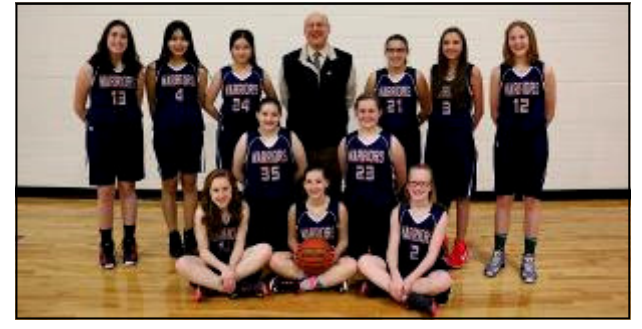
JV Girls Basketball Team